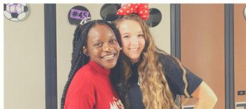
TITAN FAN $10.00/Month