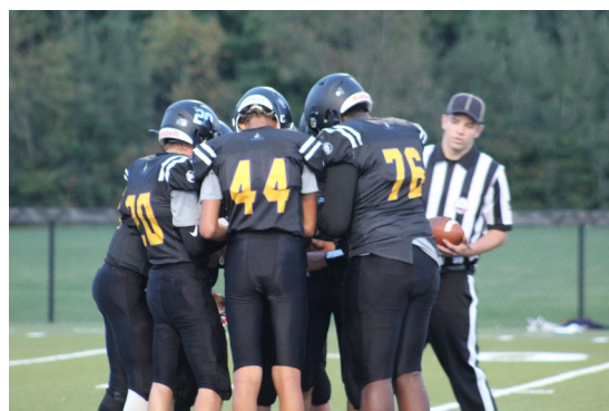
A new football co-op started this year between ML, LMC, and Countryside. The Twin City Sharks now compete as a unified team in the SW 8-man conference.

Congratulations to the ML girls volleyball team on another district championship. What makes it more special is that it was won on our own home floor! Way to go Lady Titans!