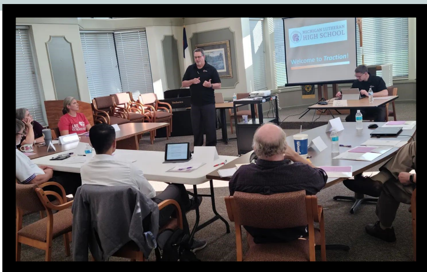
Faculty and Board members meet with Grace in Action to determine our Core Values, Uniques, and set our VTO for the future ministry at MLHS.

Over a two-day period, the leadership of MLHS embarked on setting a vision for the future of this ministry. Out of this time together came our VTO (Vision/Traction/Organizer). This VTO is our guiding document on where we believe, God-willing, MLHS can be in six years if we carry out this mission faithfully. There are goals for student enrollment growth, financial sustainability, debt reduction, facility improvement, and faculty growth. Improved communication is a part of this so that many can see and be a part of the exciting mission of MLHS. A new leadership model will set our leaders up for success and give them the needed time to carry out their responsibilities. Please pray for God to bless this work so that many more can experience Christ-Centered Learning for Christ-Centered Living at MLHS!