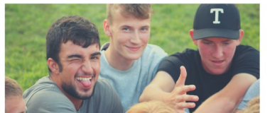
TITAN DONOR $20/month